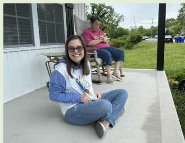
The ladies sitting on the porch on a pretty day.