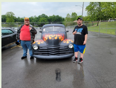
A fun day at the car show!