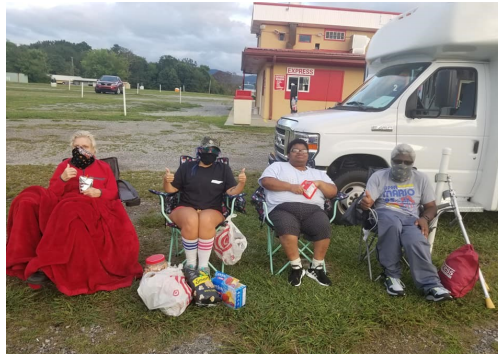
People we support and staff enjoying "Drive-in Movie Night" together